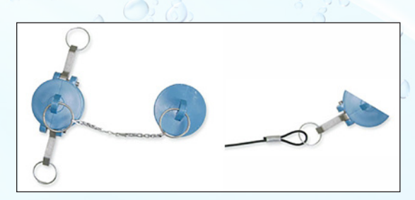
SS Sash Chain or Nylon Coated SS Wire-Rope